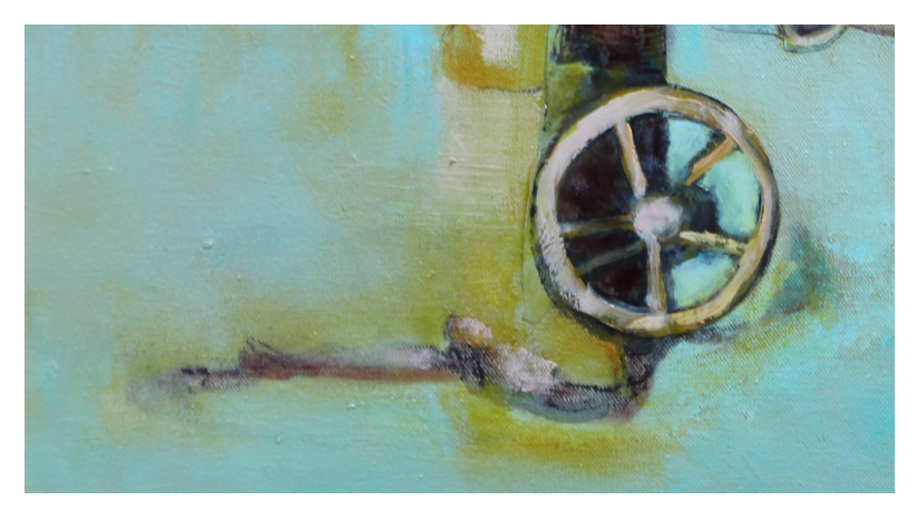
Image Credit: "Over Turn". oil and mixed media on canvas_50 x 40 cm_2021_Judy Carroll Deeley

1. 'POST-EXTRACTIVIST LEGACIES AND LANDSCAPES: HUMANITIES, ARTISTIC AND ACTIVIST RESPONSES' | The Andrew W. Mellon-funded CHCI Global Humanities Institute 2022-2023 (total grant: €200,028)